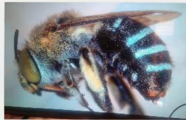
UFO Identification-Native Bee Study