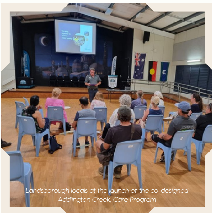
Landsborough locals at the launch of the co-designed Addlington Creek, Care Program

Addlington Creek flows through the eastern side of Landsborough and is the main inflow into Ewen Maddock dam, which supplies drinking water to the Caloundra area. The program aims to improve the habitat along creek lines to improve water quality flowing into Ewen Maddock dam. SEQ Water has funds available for weed control, erosion management, and native planting works along Addlington Creek.