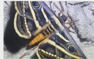
Moth Light & UV Adventures