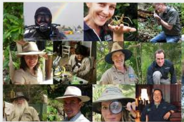
Sunshine Coast BioBlitz 2023