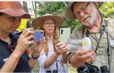
Sunshine Coast Big Butterfly Count