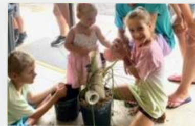
Hands on for all ages