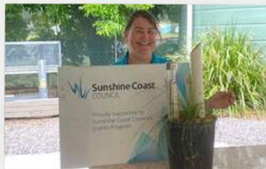
Thanks to Council for their support