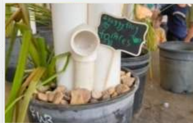
Another great frog hotel