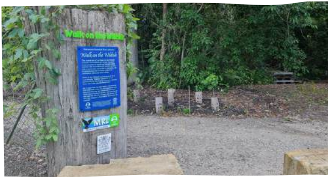
Walk on the Wildside Entrance