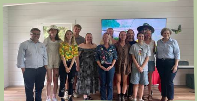
ECOllaboration graduation Dec 2024

Congratulations to the 2024 Graduated students (pictured here)! We look forward to crossing paths again with you in the near future, and hearing about your adventures.