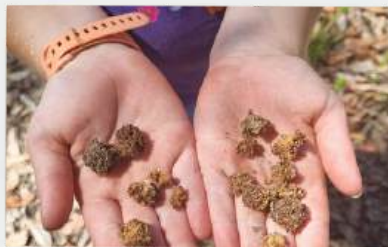
Glossy Black orts