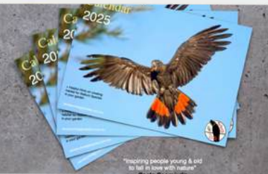
Spencer's 2025 Calendar