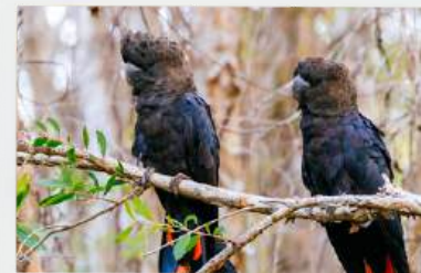
Glossy Black Cockatoos