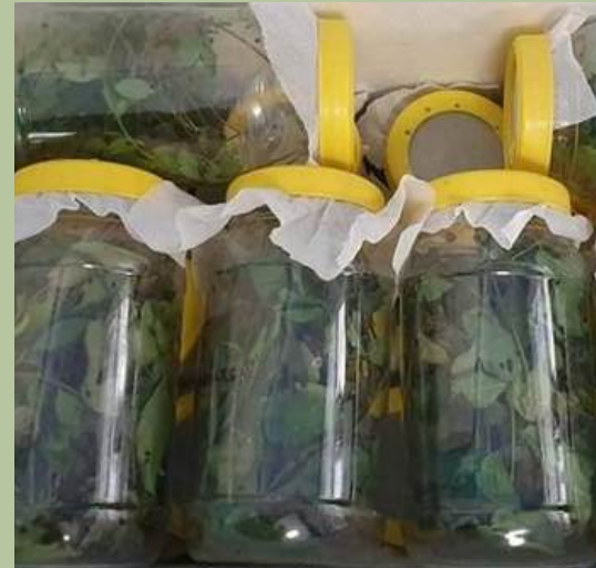
Jars of Jewel Beetles ready for release in a local Cats Claw Creeper Infestation.