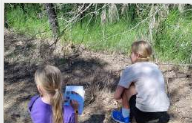
Young surveyors at work