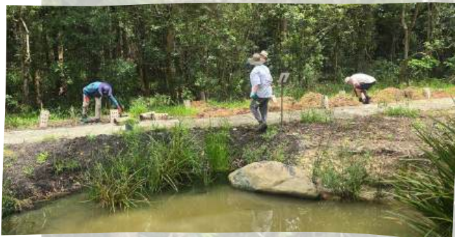
Volunteers at the last working bee Nov 2024