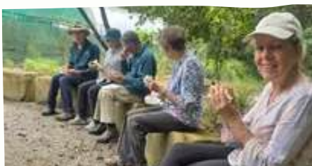
Volunteers are the heart of MRL!